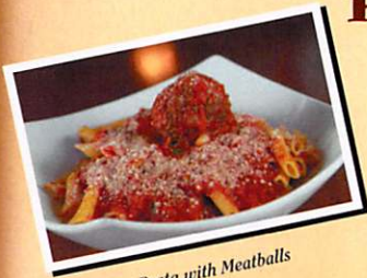
Pasta with Meatballs

Lasagna or Pasta Meatballs & Sausage with Hot Cooked Peppers Mixed Green Salad Bread: Rolls & Butter Includes: Paper Goods