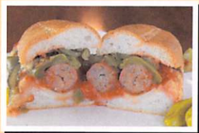
Italian Sausage with Cooked Peppers & Cheese