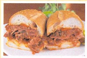
Pastrami in Sauce & Cheese