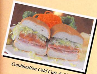
Combination Cold Cuts & Cheese

Includes: Ham, Turkey, Salami, Mortadella, Cheese, Lettuce, Tomato, Mayonnaise and Mustard