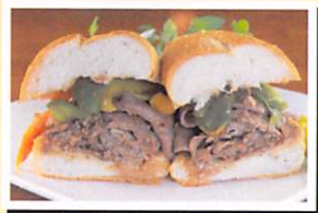
Roast Beef & Cheese