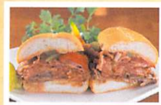
Roast Beef, Pastrami & Cheese