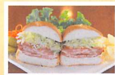
Capicola & Cheese