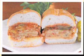
Eggplant Parmigiana and Cheese