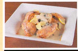
Stuffed Chicken Breast

Pasta or Lasagna, Stuffed Shells or Rice Pilaf Stuffed Chicken Breast with Lemon Caper Sauce or Mushroom Gravy Sausage & Peppers Eggplant Parmigiana Mixed Green Salad Assorted Fresh Fruit Bread: Rolls & Butter Includes: Paper Goods