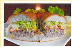
Tuna & Cheese